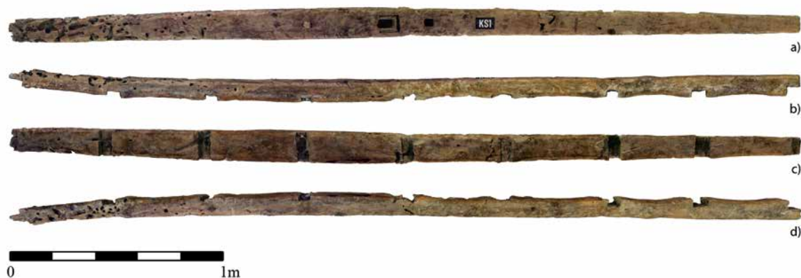
Fig. 6 Orthoimage of the four sides of the keelson: a) top view; b) view from the south-east; c) bottom view; d) view from the north-west (author: K. Yamafune)

of the keelson, at the position of frame F20, a trace of a nail that once joined it to the keel and frames is visible. After removing the keelson, on its lower side, at the position of frames F3, F20, and F21, traces of nails were observed, which were probably hammered in from the bottom of the keel, passing through the keel and entering the frames and keelson.