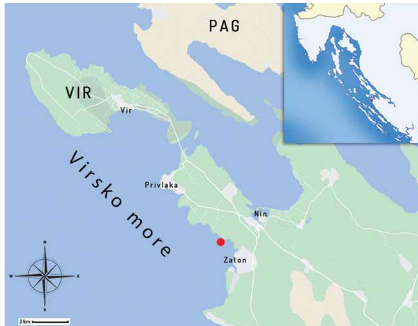
Fig. 1 Position of the site (map: D. Romanović)