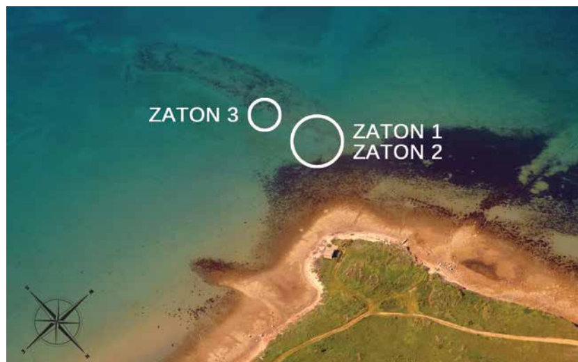
Fig. 2 Aerial photo from the north-east of Cape Kremenjača with position of the three sewn boats