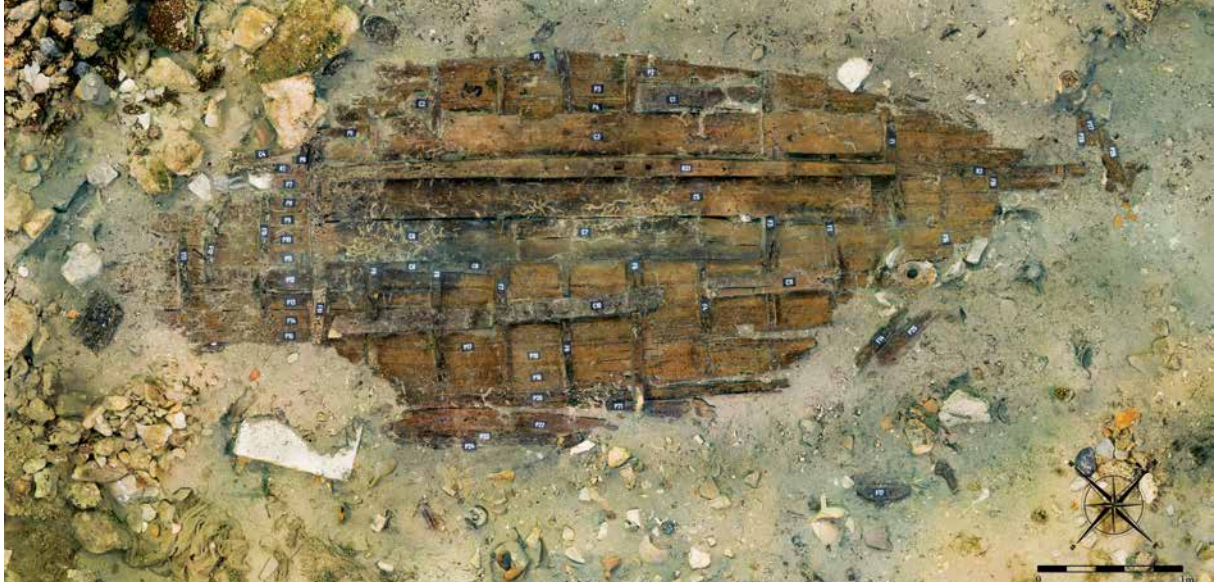
Fig. 3 Orthoimage of the first phase of Zaton 3 boat excavations in 2019: the inner carpentry (ceiling and keelson are still in place)

The best researched of the three sewn boats from the Roman-period port in Zaton is the third boat (Fig. 3). Data about Zaton boats 1 and 2 is very scarce. Only a few reports on the underwater excavations were found in the archives, and many questions about Zaton 1 and 2 remain unsolved (Romanović 2021). The remains of this third boat are in better condition than the remains of the other two. The boat's structure was explored by sections in four campaigns from 2002 to 2007, but not entirely and it was not documented in detail. During the 2019 excavations, the entire preserved boat's structure with its periphery was cleaned up and documented, providing new data on its construction.