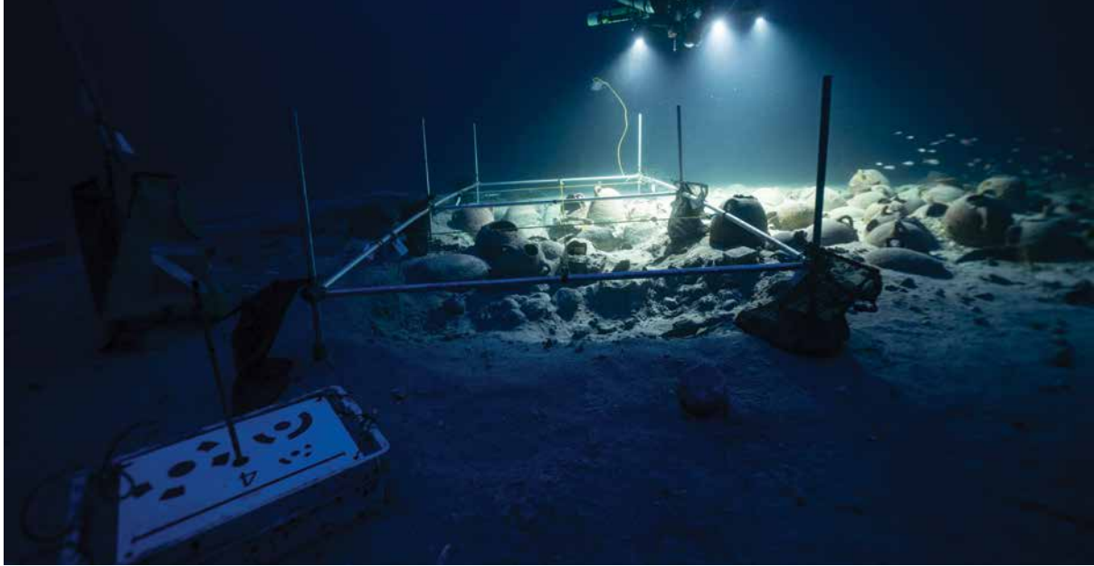
Fig. 3 The excavation area

The area chosen for excavation coincides with a part of the wreck that seemed to have been disturbed in the past. Due to earlier disturbance, there was less surface material to clear. An area of two 2 m 2 grids were installed, which allowed the divers to easily position themselves in a short time after arriving on the site. The grid also facilitated stabilisation; an important matter due to the amount of equipment carried by technical divers (Fig. 3).