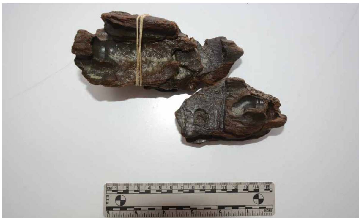
Fig. 5 Fragments of mortise and tenon found within the excavation area

In 2020, the first diagnostic wooden piece was excavated. Among fragments of wood in secondary contexts, a mortise section with a fragment of tenon and a peg still in situ was recovered (Fig. 5). This important find was subsequently raised to the surface so further studies could be conducted. Although broken into three pieces, when placed together it is relatively straightforward to understand. It consists of a section with a mortise measuring approximately 4 cm wide but of unknown length made out of Aleppo pine. The tenon (which has been identified as Olive tree, Olea europaea ) is partially preserved and has a thickness of 0.8 cm. Its exact width and length cannot be measured. The peg, also made from Olive tree, has a diameter of 1 cm with an unknown length. Further in-depth studies are being carried out on all the wooden fragments recovered from the wreck. Based on the current evidences of structural elements, we propose that the hull could have been made from Aleppo pine using a mortise and tenon construction method. This should be confirmed once more elements from the structure appear.