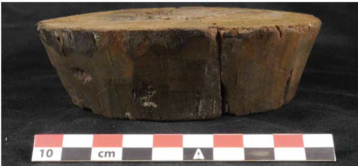
Fig. 4 Wooden stopper of one of the extracted amphoras

After seven seasons of diving at least seven amphora typologies have been identified. Petrographic studies of some of the ceramic containers indicate that some of the cargo originated in Tunisia, Malta and Sicily (Anastasi et al. 2021). The saddle querns were confirmed to have been quarried on the island of Pantelleria, situated to the northwest of Gozo (Renzulli et al. 2019). As with most ancient wrecks, the amphoras found on the Xlendi site were unsealed. Most of the necks of the containers were found broken or the seals were lost at some point after the ship came to rest on the seabed.