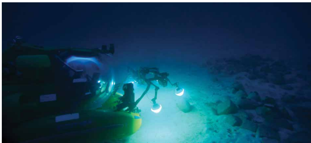
Fig. 2 Inspecting the site with the Comex manned submersible

In 2014, an international team consisting of personnel from the University of Malta, the CNRS ( Centre National de recherche Scientifique ), and Comex returned to the site to acquire high resolution imagery, create a detailed 3D photogrammetric model and to recover some objects. To achieve these objectives, dives were made with a small, manned submersible. This approach permitted the team to inspect the site at proximity as well as to make the first close observations (Fig. 2). The photogrammetric documentation produced on these inspections permitted the planning for object recovery.