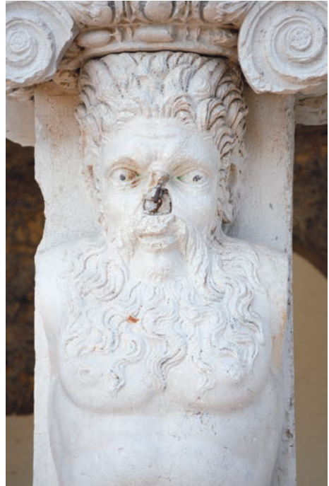
Fig. 3: Vincenzo and Giangirolamo Grandi? Telamon from former Fanfogna palace in Zadar

previous three centuries, the most popular and politically important relics of st. Simeon the Prophet - indicates the extremely difficult historical circumstances in Zadar at the time 12 . Except for the church, of which only St. Roch's chapel built after 1508 and the southernmost Quattrocento façade pilaster survived, several other buildings were sacrificed to the new bastion called terrapieno , i.e. the houses that occupied the area of bastion's new ground plan set exactly on the church axis 13 . In recreating Cinquecento vista of the area (today unrecognizable due to WW2 bombardments) one should also understand that this was a highly respectable quarter located in the immediate neighbourhood of Zadar civic centre with, then only recently rebuilt, the town Loggia and Gran Guardia and several local aristocracy palazzettos , such as Civallesi, Pasini, etc 14 . Fanfogna family was one of the oldest and most respected