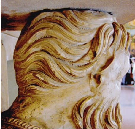
Fig. 8: Vincenzo and Giangirolamo Grandi - Fireplace telamon in Sala Grande, Castello del Buonconsiglio, Trento

The present Tridentine museum's permanent collection ( Monumenti e collezioni provinciali ) also exhibits fragments of the second fireplace attributed to Vincenzo and Giangirolamo Grandi, which was probably made for the ground floor room, so called Camera del basso del torrione 50 . These