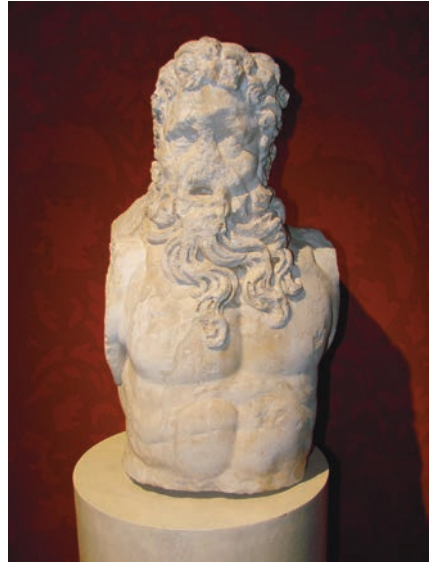
Fig. 9: Vincenzo and Giangirolamo Grandi - Limestone herm from Castello del Buonconsiglio

during the 16 th century in Veneto, there are no examples closer to Zadar satyrs than this Tridentine bust, rightfully attributed to the Paduan masters. Furthermore, it seems that the design of unique decorative patterns of Zadar lapidarium fragments should also be linked to Vincenzo and Giangirolamo's Tridentine experiences since similar monsters with elongated necks swirled around fleshy leaves are found on the third and the fourth Zadar fragments as well as (most probably) on the lost museum architrave 55 of St. Donatus. The ultimate connection with Grandis' style can be found in the sinuous lines of bellies of registemmi's satyrs which will also appear in the works of their second Paduan sojourn.