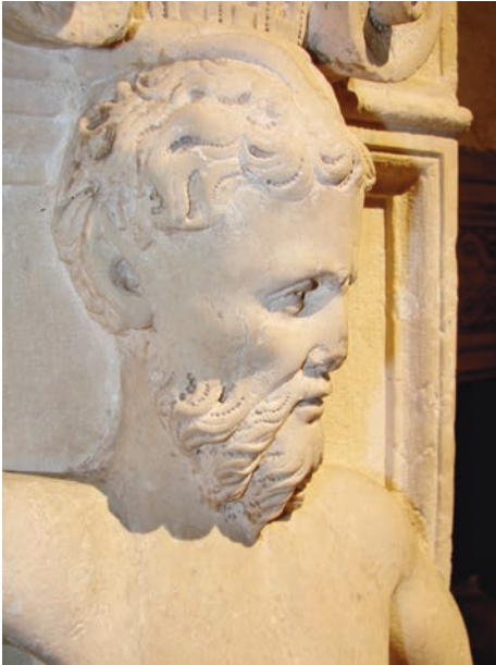
Fig. 7: Vincenzo and Giangirolamo Grandi - Fireplace telamon in Sala del Basso del torrione in Castello del Buonconsiglio, Trento

chiselled. The countenances of satyrs-telamons are emphatically expressive in their knitted brows and open mouths. However, even more than several physiognomic resemblances (such as details of hair, ears, brows and muscles), morphological features are relevant for their formal linking with Zadar telamons. Tridentine satyrs' hair has been formed with distinctive staccato , disobedient tufts among which arrays of drilled perforations can be seen. Similar perforations have been applied in several other works by Vincenzo and Giangirolamo as well as in Zadar satyrs. This sculptural treatment had often been used by Quattrocento sculptors 49 by which a stronger plasticity and sharper chiaro-scuro effect was obtained,