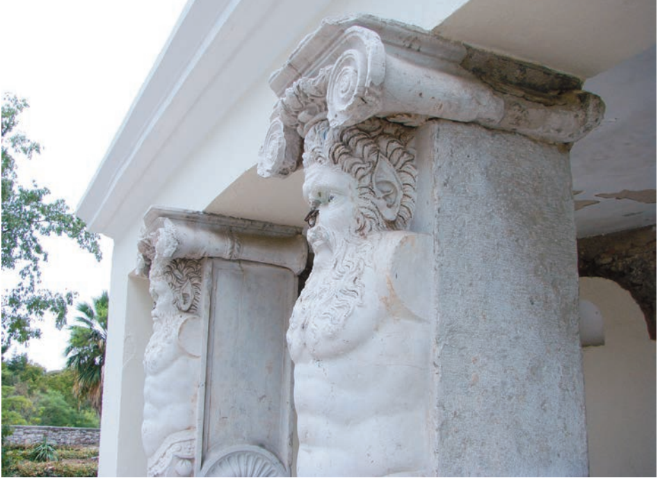
Fig. 2: Vincenzo and Giangirolamo Grandi? - Telamons from former Fanfogna palace in Zadar

stalled on 19 th and early 20 th century pseudo-architecture speaks in favour of dating Zadar telamons into the 16 th century 9 .