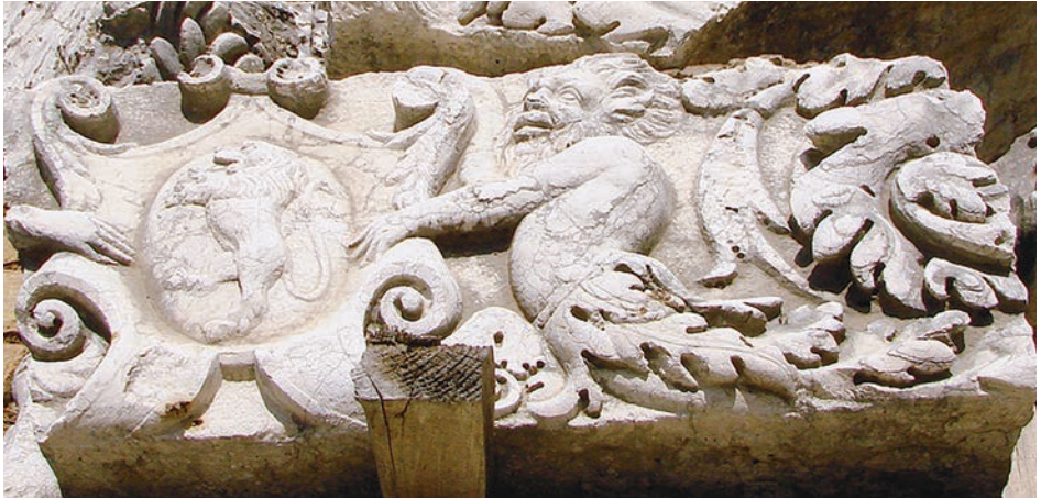
Fig. 4: A fragment of Fanfogna palace architectural decoration in the lapidarium of Narodni muzej in Zadar

ornaments with Fanfogna coat-of-arms» 24 . It is important to notice that these four (two in lapidarium and two lost) are the only known 16 th century satyrs' registemmi in all of Venetian Dalmatia, but for its iconographical uniqueness, the third and the fourth lapidarium fragments 25 are even more peculiar. On the left side of the third fragment, otherwise fully decorated with the same type of foliage, there is a dragon's head with open jaws devouring a grapelike bunch laid on the leaves. The dragon's elongated neck is transformed into tendrils curved around fleshy foliage. The monster's head is curved similarly to satyrs' bellies and the contours are in the same way subjected to the general undulated rhythm of the composition. On the far right of the third fragment a strange hybrid monster is represented, with its right side destroyed, making it rather difficult to understand its concept: its horned lion's head is frontal, but set on what seems to be the back