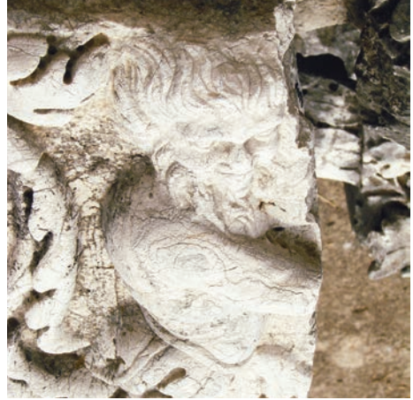
Fig. 3: A fragment of Fanfogna palace architectural decoration in the lapidarium of Narodni muzej in Zadar

Except for the two telamons, there are four fragments 22 of an architrave preserved in the lapidarium of Narodni muzej in Zadar that have been part of the Fanfogna house decoration. The fragments were once part of the portal or balconata architrave and are marked with Fanfogna 23 coat of arms carried by two whimsical satyrs whose bodies' lower parts are transformed into foliage, while the architrave's lateral parts are decorated with thickly