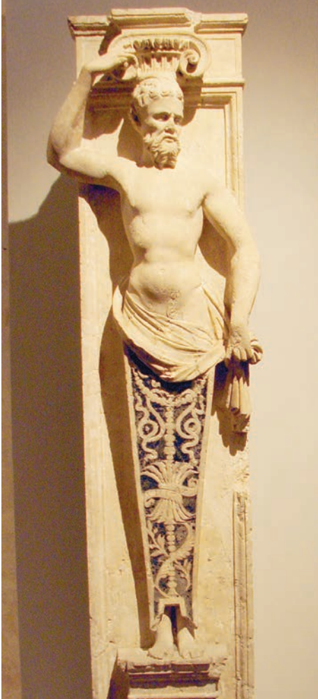
Fig. 10: Vincenzo and Giangirolamo Grandi - Fireplace telamon in Sala del Basso del Torrione in Castello del Buonconsiglio, Trento

erences 57 . Particularly interesting is the pilaster strip with Giangirolamo's (signed 1546) depiction of excellently foreshortened drunken Noah lying at the foot of the grape vine with naturalistic snails, birds and an intermingled snake. Noah's bulging figure is formed similarly to Zadar architrave satyrs- registemmi , particularly in caricatured outline of his bloated belly. In this context, it is also worth to single out the tomb of Simeone Ardeo dated in 1548-1549 58 , also in Santo, where pilaster telamons have been chiselled with decisive cut and developed sense of plasticity, already noted on the fireplace in Tridentine Sala Grande and in Zadar telamons. Besides that, Ardeo coat of arms' shield type and its phytomorph putti-registemmi could be seen as variation of Zadar examples. Kindred forms are executed in Giangirolamo's bronze works 59 . Yet another Grandis' monument dated into this period is that of Paduan university law professor Giovanni Antonio de Rossi (Rubeis), today in the noviciate cloister of Santo. The commis-