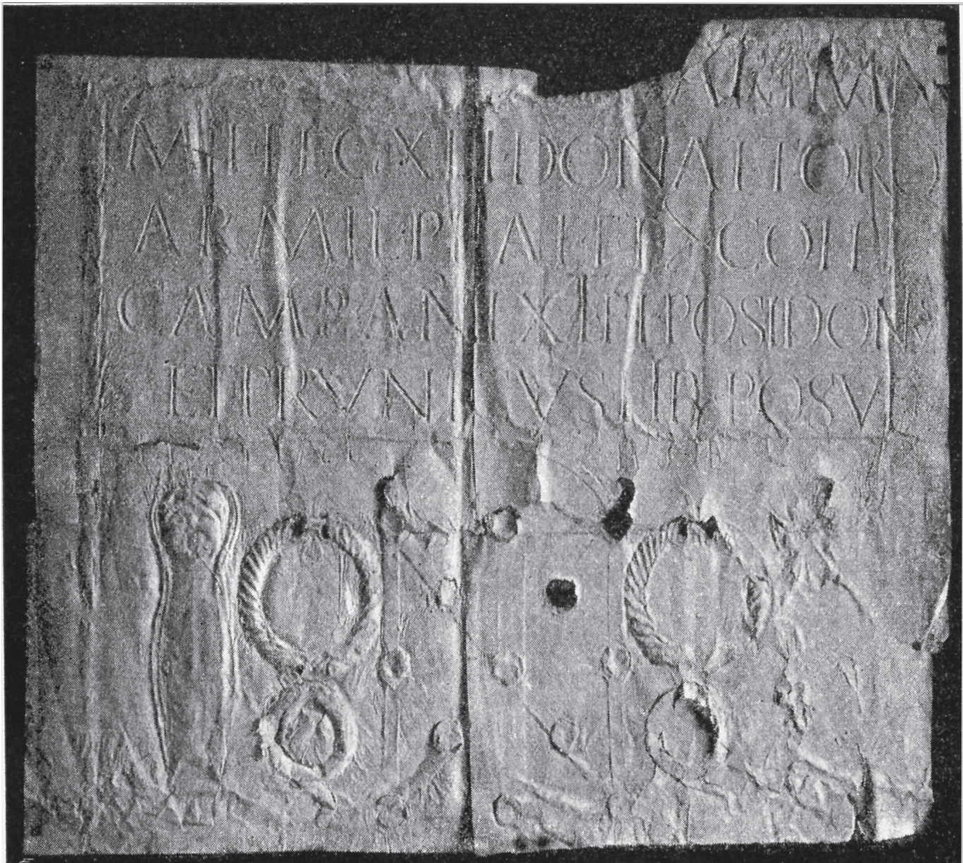
SL. 1. / FIG. 1.

Otisak pročelja naronitanskog spomenika CIL 3, 8438 (prema H. HOFMANN, 1905, 22, sl. 13).