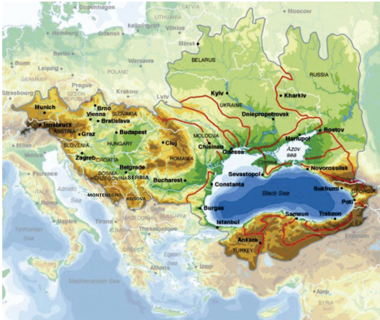
Figure 1 Countries in the Black Sea Watershed in 2012

The above mentioned coastal states, however, are hardly the only countries that use and affect Black Sea ecosystem resources. In addition to them, sixteen or seventeen countries - Albania, Austria, Belarus, Bosnia and Herzegovina, Croatia, the Czech Republic, Germany, Hungary, Italy, Kosovo (not recognized by the majority of UN Member States), Moldova, Poland, Slovakia, Slovenia, Switzerland, Serbia, and Montenegro - own parts of the Black Sea watershed (Fig. 1) and, therefore, need to be acknowledged as parties responsible for the sustainable management of the Sea.