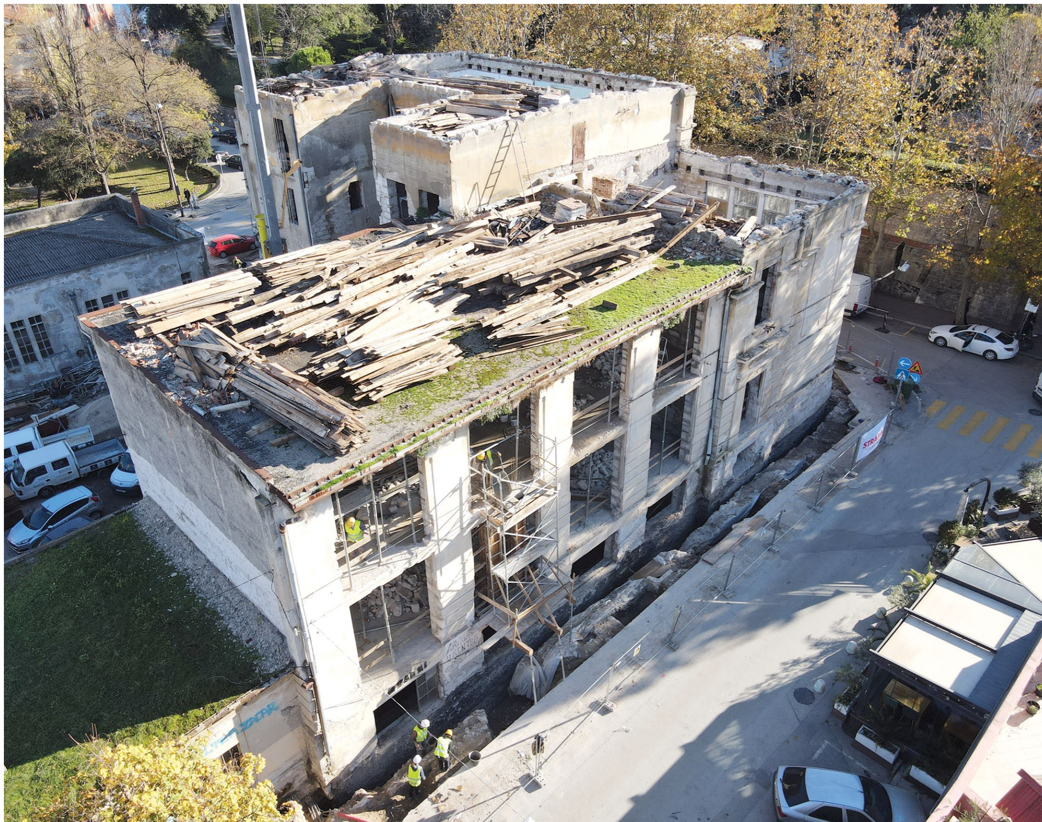
Pogled na zonu istraživanja sa sjeverozapada View of the excavation zone from the northwest

Spomenuti graditelji osmislili su preinake zadar- skih fortifikacija na jugoistočnom dijelu poluotoka, koje su podrazumijevale dodavanje bastiona uz srednjovjekovnu Citadelu i bastiona sv. Marcele te izgradnju novog bastiona Ponton, između njih. Od