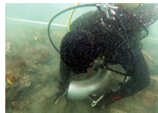
Iskop na prostoru broda Trstenik 3 Excavation in the area of ship Trstenik 3

Ship Trstenik 3 was laid in the east-west direction, on the south side of the structure of the operational quay made of vertically placed planks and wooden piles. On day one of the excavation, equipment for underwater work was prepared. Above the site, an auxiliary metal grid was placed, consisting of 2 x 5 squares, with overall dimensions of 4 x 10 m. After the grid was installed, underwater excavation followed, which completely defined the ship's structure on the north and south sides. On the north side of the excavation, a place for temporary disposal of the removed stones was marked with a buoy. As in the case of ship Trstenik 1, on the north side the ship's structure was well preserved up to the height of the operational quay structure, while on the south side it gave way under the pressure of the stones. Therefore, it is not clear whether its southern part has been completely recovered or if it is only a part of the