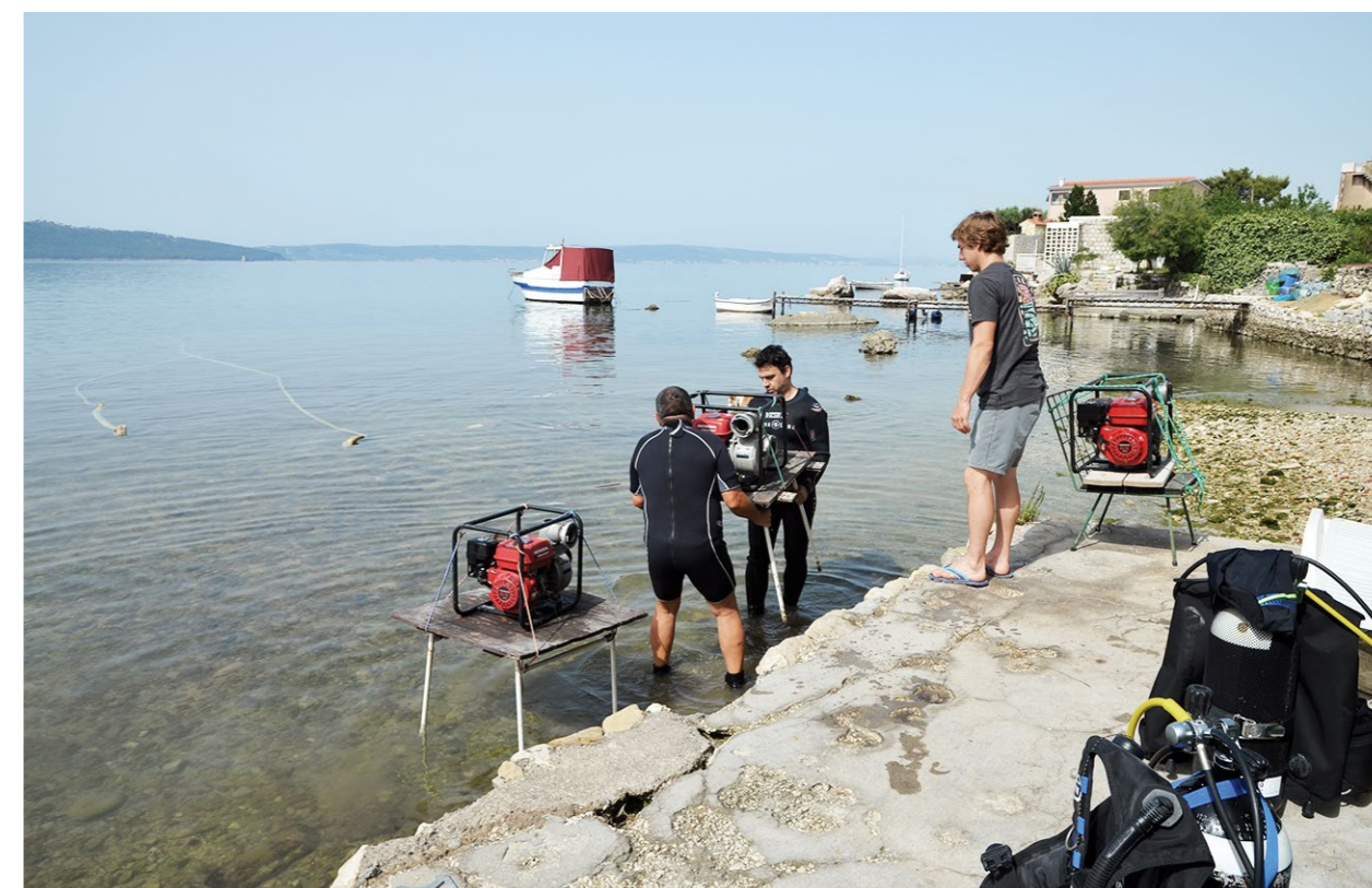
Priprema pumpi za pokretanje vodenih sisaljki Preparation of pumps for starting water dredges

koji se u rimsko doba nalazio na ovom prostoru. Izgradnjom stambenih objekata i infrastrukture njegovi su ostatci na kopnu već odavno uništeni, ali su se u plitkom moru očuvali jasni tragovi njegova postojanja.