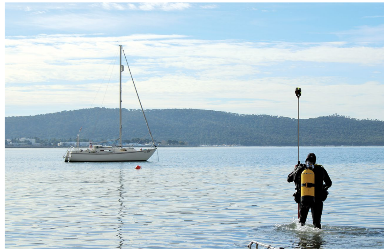
... Priprema za snimanje referentnih točaka na nalazištu pomoću totalne stanice ... Preparation for recording reference points at the site using a total station

stao samo sloj čisteg kamenja i akumuliranog sedimenta.