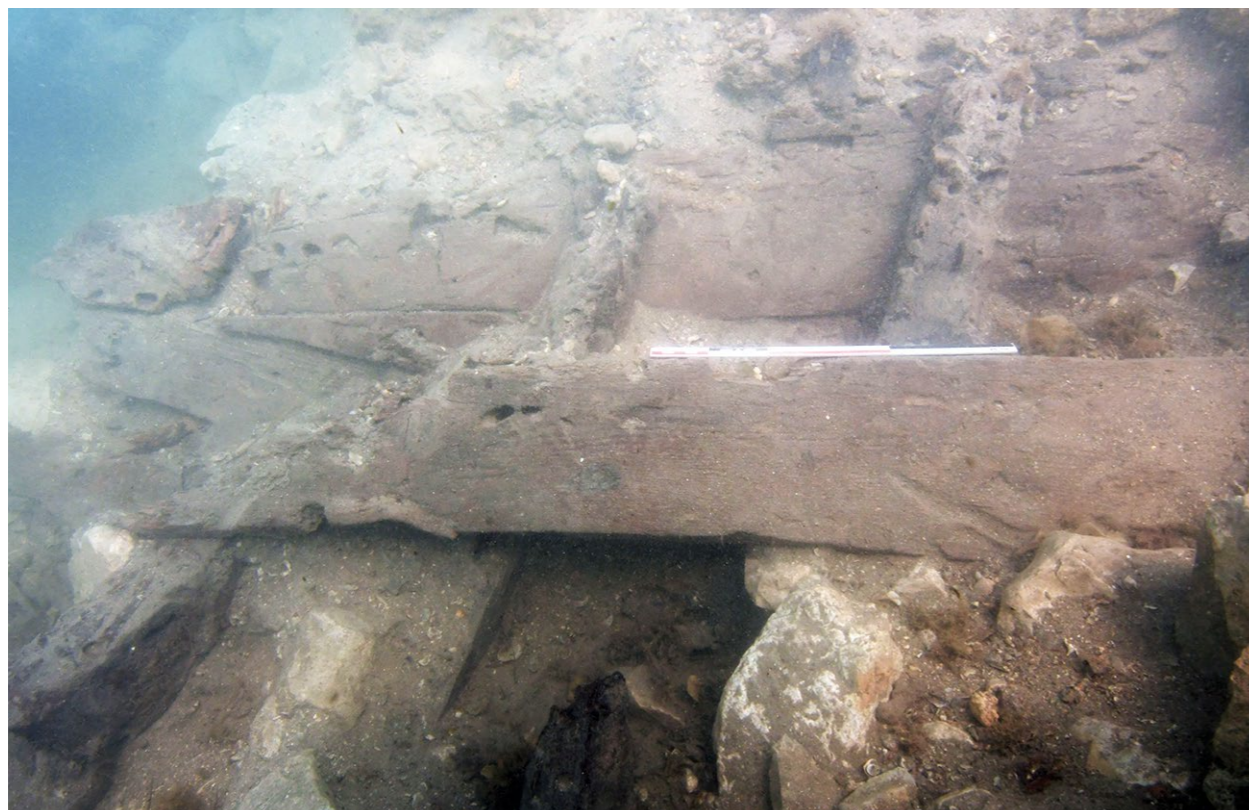
... Krajnji pramčani ili krmeni dio broda Trstenik 3 ... The end bow or stern part of ship Trstenik 3

le, dok je s južne strane popustila pod pritiskom kamenja. Nije, stoga, jasno je li njezin južni dio u potpunosti otkriven ili je riječ samo o dijelu broda pod kamenim nabačajem, koji se zapravo proteže i dalje prema jugu.