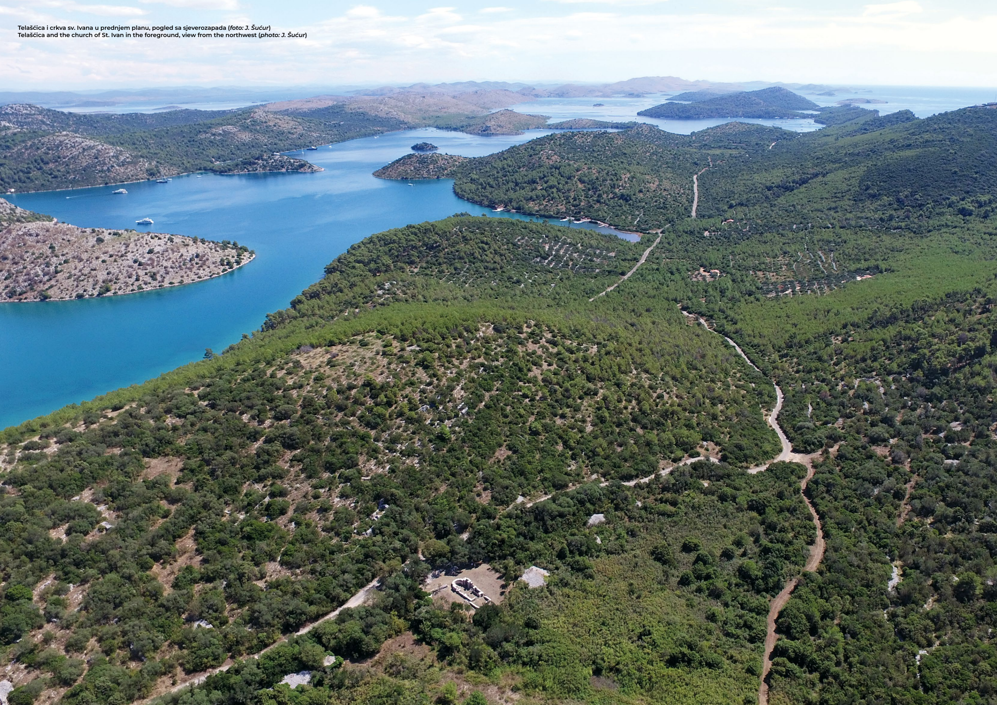
Telašćica i crkva sv. Ivana u prednjem planu, pogled sa sjeverozapada Telašćica and the church of St. Ivan in the foreground, view from the northwest