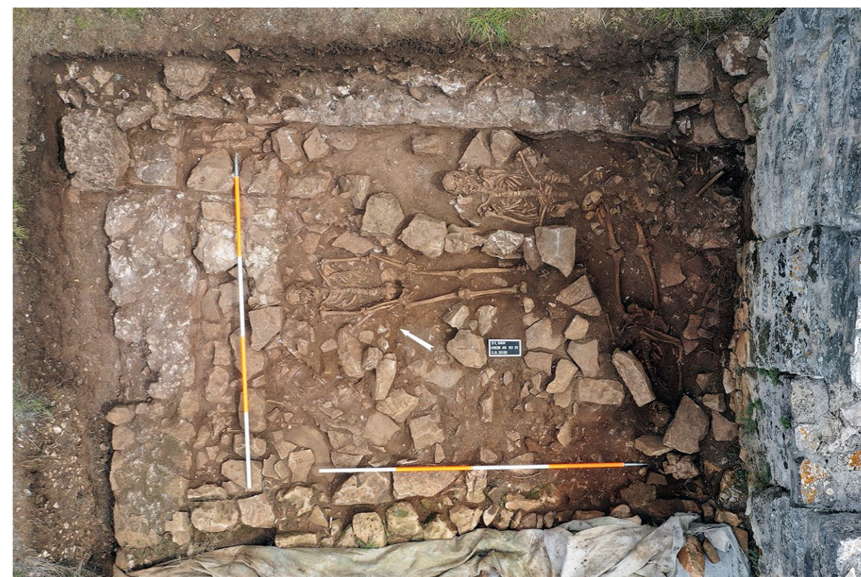
... Dio grobova istražen u ovogodišnjoj kampanji ... Some of the graves explored in this year's campaign

Small finds consist of numerous fragments of late antique pottery, shells, fragments of human and animal osteological remains, less numerous fragments of glass and metal objects (nails, needles). Among them, particularly interesting are the