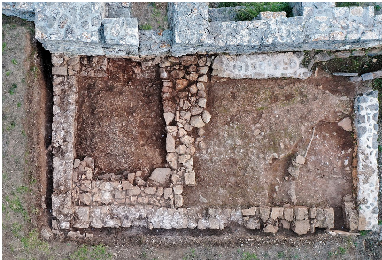
Završna situacija na kraju ovogodišnje kampanje... Final situation at the end of this year's campaign

bilo je moguće determinirati u vrijeme Flavija Viktora (387. – 388.), a iskovana je u Lugdunumu , na prostoru današnjeg Lyona u Francuskoj.