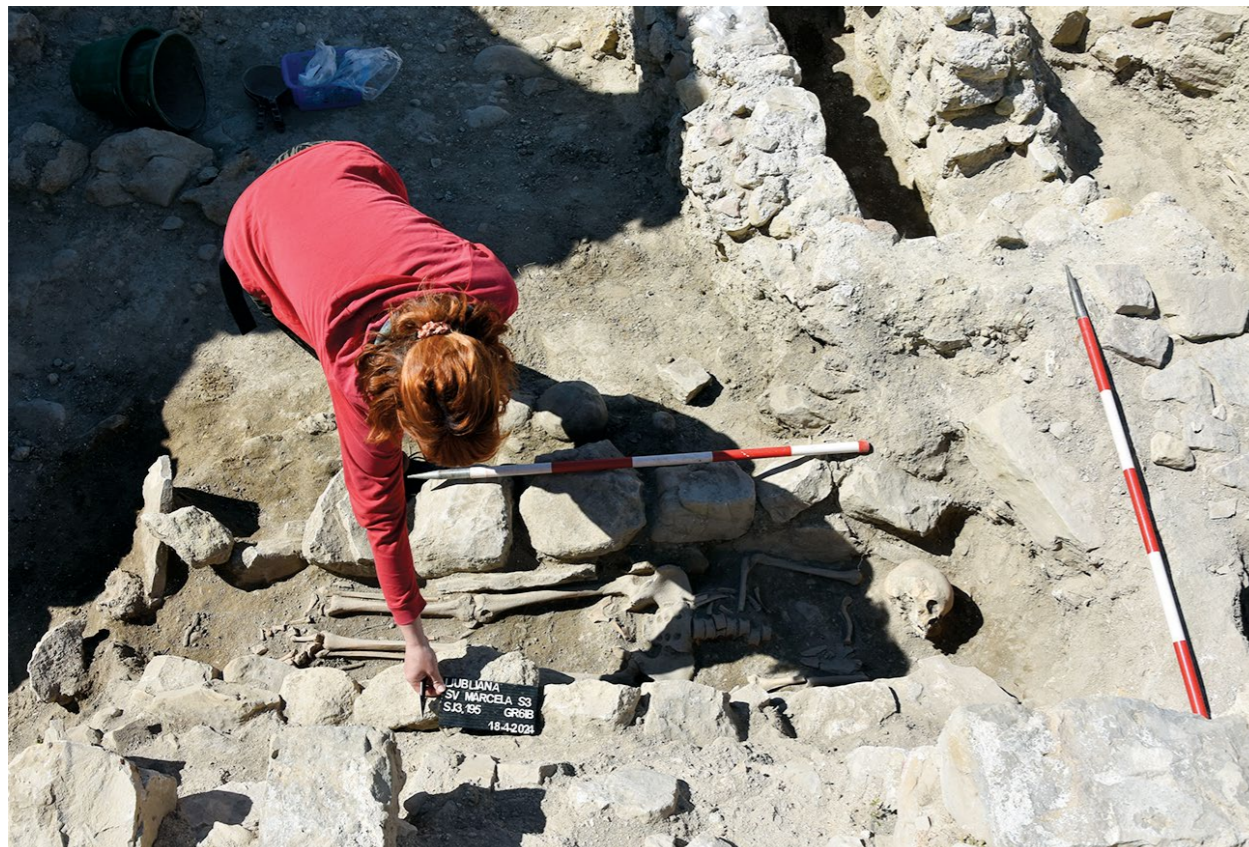
... Dokumentacija ... Documentation

ječ je o ostacima zidova starijih objekata, ali zbog činjenice da su slabo sačuvani ili otkriveni na maloj površini, ne možemo govoriti o tome kakvom tipu objekta ti zidovi pripadaju.