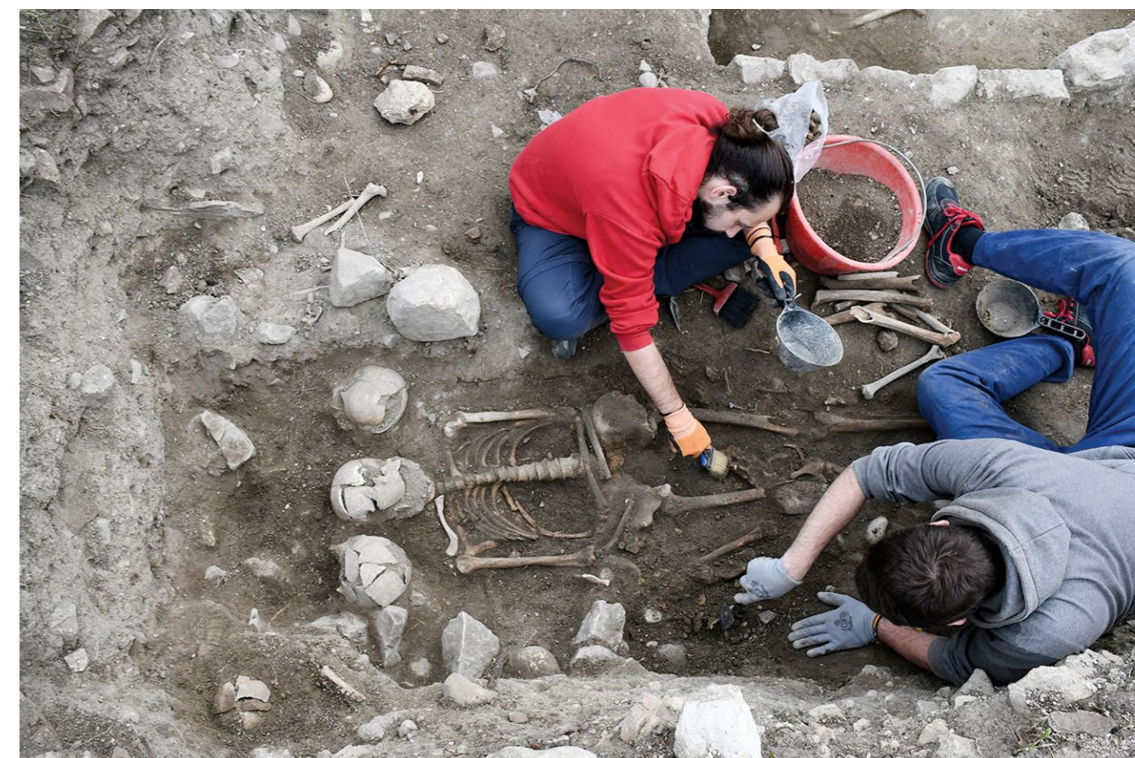
Čišćenje groba Grave cleaning

In the area around the church of St. Mary, since the last campaign, we have been focused on exploring the area south of the church. Although the initial area was 7x10 m, the area has been expanded on several occasions, primarily due to various graves whose complete research required expansion. The level from which we began this year's excavation is located at a depth of 120 cm from the top of the southern profile and at a depth of 75 cm in relation to the northern profile. In the last campaign, the youngest layer of graves, the one that could roughly be dated to the Late Middle Ages, was largely removed. However, different levels of burying, multiple, successive burials at the same place, mean that graves from a younger phase oc-