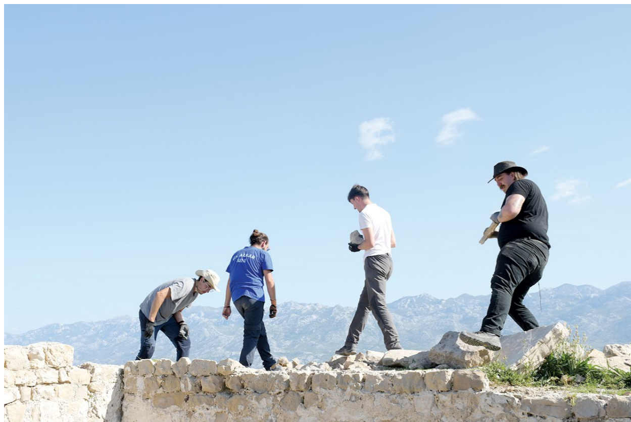
⋮ Retrogradna evolucija ⋮ Retrograde evolution

The difference compared to the previous campaign is that during this year's excavations, finds from the time of Late Antiquity were unearthed. The remains of a corner of a building made of carved stone bound with plaster were found in the northwestern corner of the church extension, after the removal of the graves. The building does not follow the orientation of the church, so it is questionable whether it is a sacred building. Its interior was covered with a layer of soot, under which thin marble slabs were found, which probably constitute the paving of the said space. In the very corner of the building there was also a grave that broke through the floor of the building. The stone-built tomb was covered with a 17 cm thick sandstone slab that cracked due to later burials in the same place. All sides of the grave are plastered. The deceased was found in situ in the grave, lying on his back in an extended position with his arms alongside his body. Scattered bones from an older burial in the tomb were also found next to him. Although at the time of writing the paper, 14C dating results had not yet been obtained, and no datable finds had been found with the deceased, based on the stratigraphic relationships and characteristics of the structure, we can most likely date it to the time