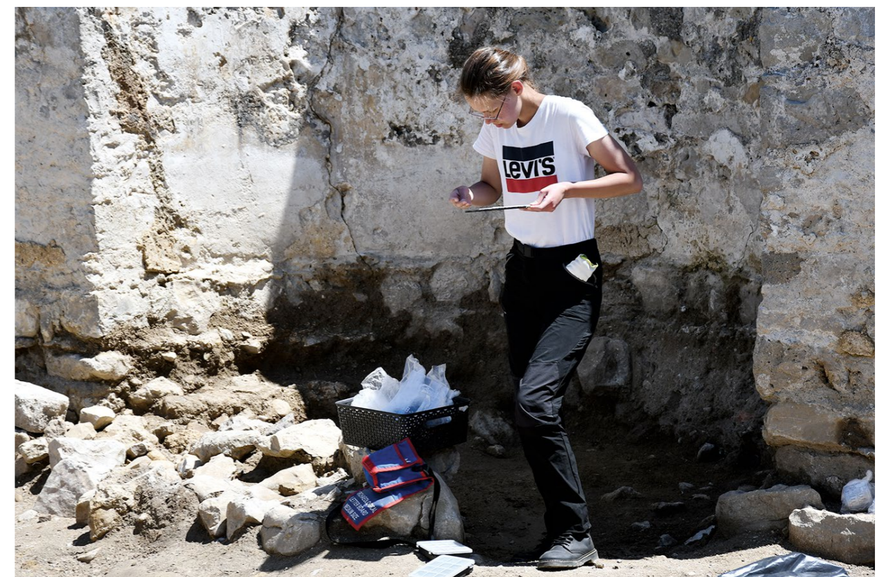
... Priprema za dokumentaciju ... Preparation for documenting