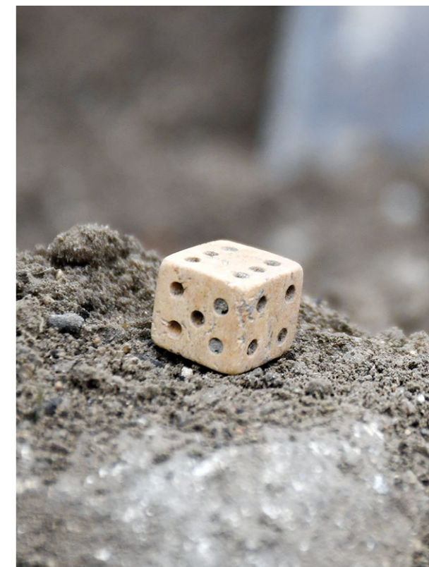
Nalaz rimske kocke (foto: N. Ćuk) Find of a Roman dice (photo: N. Ćuk)

Grobovi zauzimaju većinu istražene površine, no na razini iznad zdravice vidljive su i pojedine strukture nepovezane s pogrebnim ritualom. Izuzev jednog zida slagana od klesanog i amorfnog kamenja uz slabu upotrebu žbuke, koji je u određenim fazama groblja služio kao ogradni zid, ostale su strukture relativno kronološki starije od pokopa jer su uništene pri ukopavanju grobova, čak i onih najranijih. S druge strane, iste te strukture nemaju direktnu vezu s crkvom Sv. Marije, nego se nalaze stratigrafski ispod, tj. starije su od same crkve. Ri-