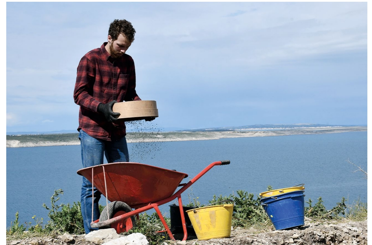
... Prosijavanje ... Sieving

As there have been some unexplored parts of the triapsal section since the last campaign, graves from all the periods represented have appeared in this campaign. A total of 84 graves have been found and explored so far. The situation is not much different from the previous campaign. The younger phase of burials continues to consist of tombs made of stone blocks, slabs or amorphous stones, laid without the use of plaster. Judging by the research so far, this last phase of burials can be placed at the time when the use of the apsidal space as a sacred part ceased at the very end of the 17th and beginning of the 18th century (Vujević et al. 2024).