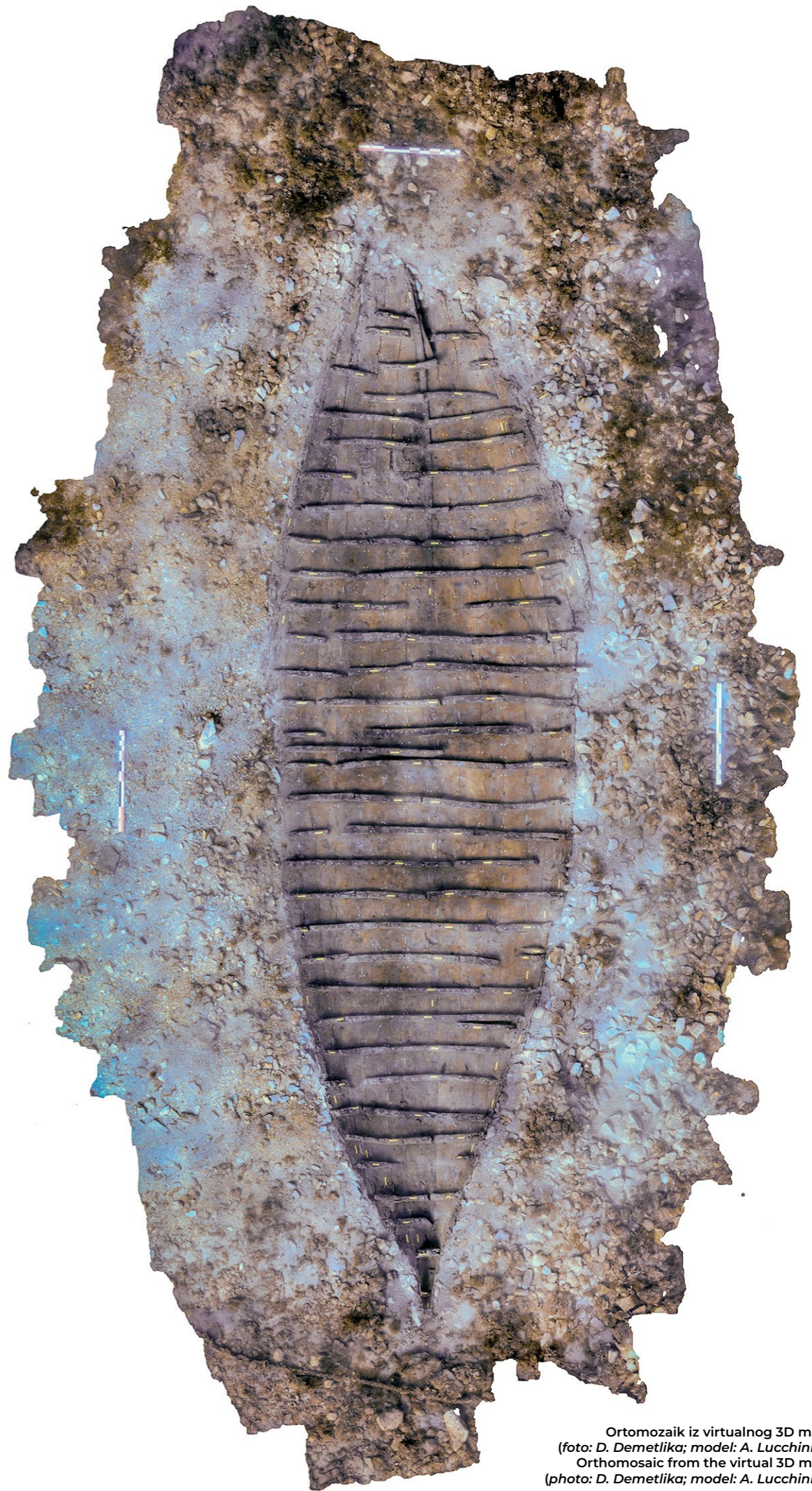
Ortomozaik iz virtualnog 3D modela nalazišta (model: A. Lucchini, K. Yamafune) Orthomosaic from the virtual 3D model of the site (model: A. Lucchini, K. Yamafune)