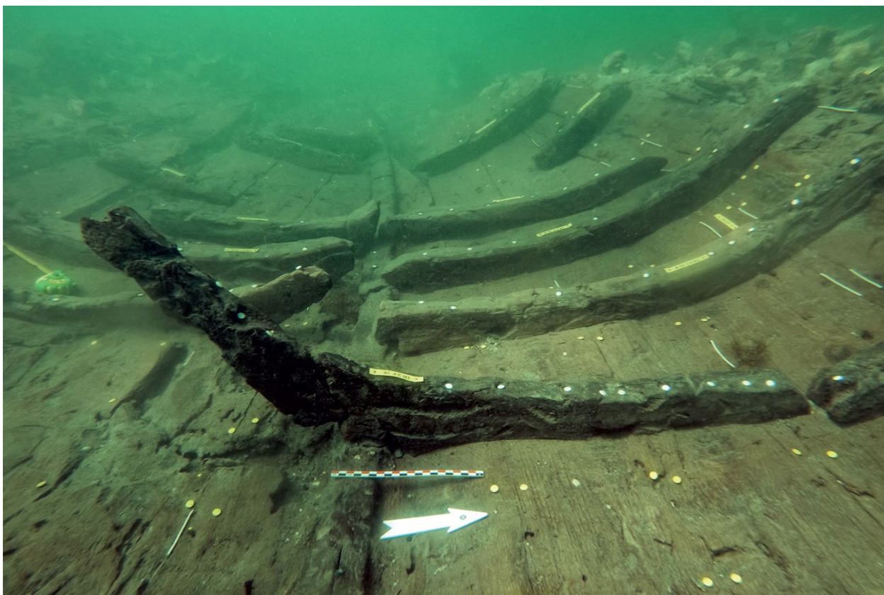
Krmeno rebro TR 3.F 28 Stern frame TR 3.F 28