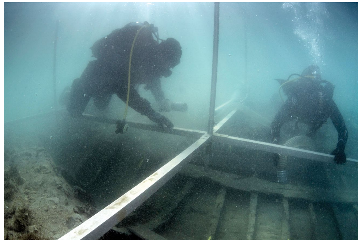
Početak istraživanja na nalazištu Beginning of the excavation at the site

The next step involved the removal of large stones and geotextile fabric that had been used to temporarily protect the shipwreck on the seabed during the previous year. Due to the volume of material, this process took two working days. The stones were first moved outside the grid and then transported in baskets to a designated pile north of the ship. Then the geotextile was removed, and fine cleaning of the ship's remains began. The removal of accumulated sediment occupied the next three working days. Once cleaning was completed, all elements of the ship's structure were marked accordingly. The markings included the abbreviation for the ship's name TR 3 and English-language designations for individual structural components: K = keel; SM = stem; SP = sternpost; F = frame; P = plank; W = wale; S =