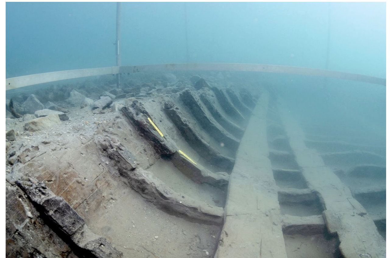
Pogled na ostatke broda s provezama in situ View of the ship remains with stringers in situ

ne po stani svijeta, tj. oznaka N ( north ) postavljena je na elemente sjeverno od kobilice, a oznaka S ( south ) na one južne. Nakon što je dovršeno označavanje nalaza napravljeno je prvo fotogrametrijsko snimanje kojim je zabilježena situacija na morskom dnu. S obzirom na to da su proveze prekrivale spojeve između rebrenica i rebrenih nastavaka, odlučeno je da se one pažljivo uklone i dokumentiraju na kopnu, a potom vrate na nalazište, umotane u geotekstil. Budući da je uklanjanje proveza rezultiralo ponovnim zasipanjem broda sedimentom, pristupilo se finom čišćenju koje je rezultiralo u cijelosti očišćenom brodomskom konstrukcijom.