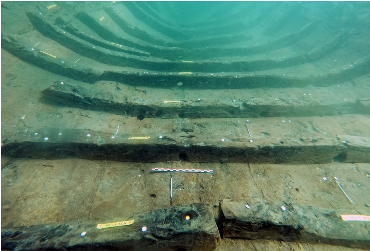
Tri slivnice na rebru TR 3.F 13 Three limber holes on the frame TR 3.F 13