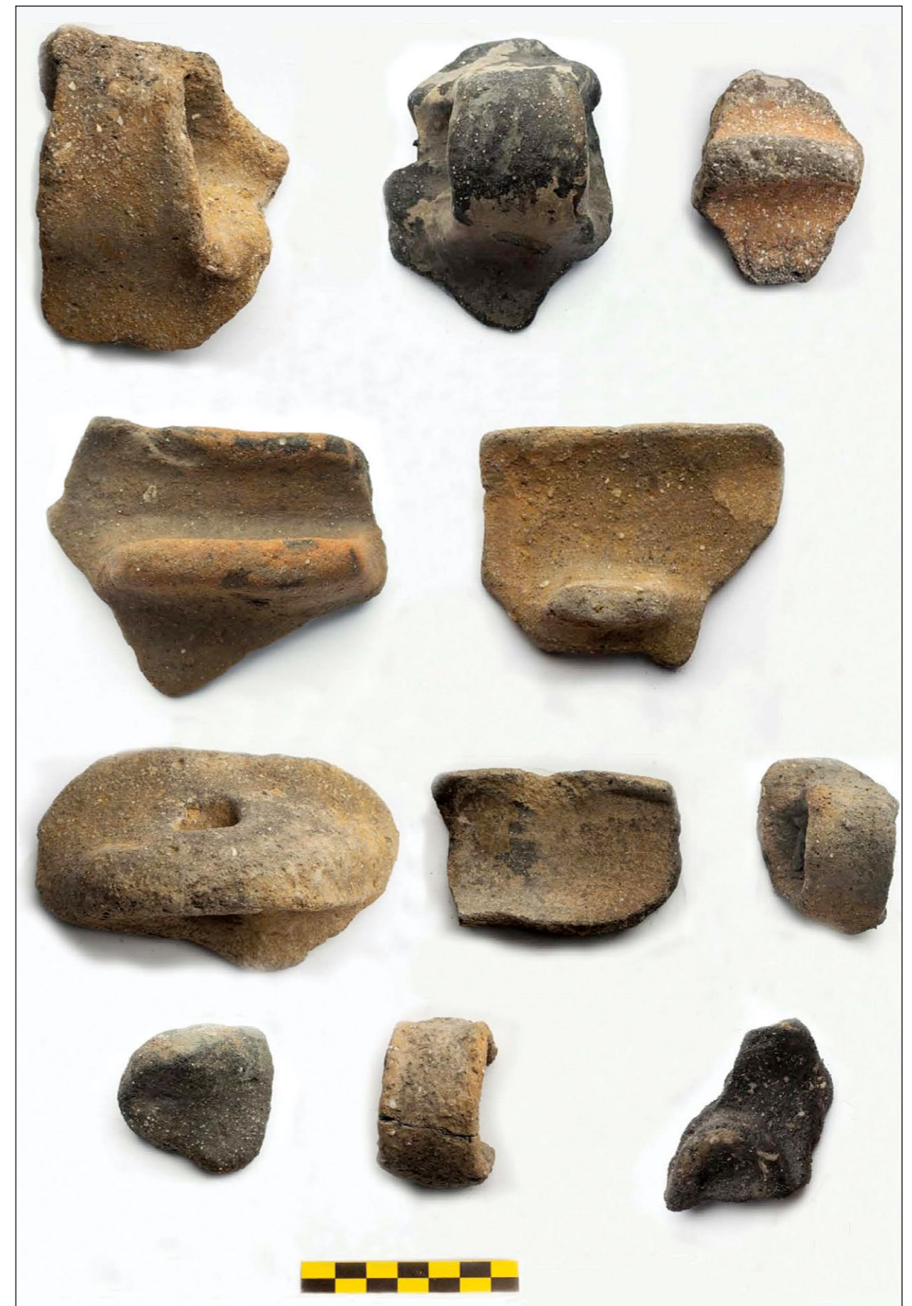
Ulomci prapovijesne keramike iz sonde Fragments of prehistoric pottery from the excavation trenches