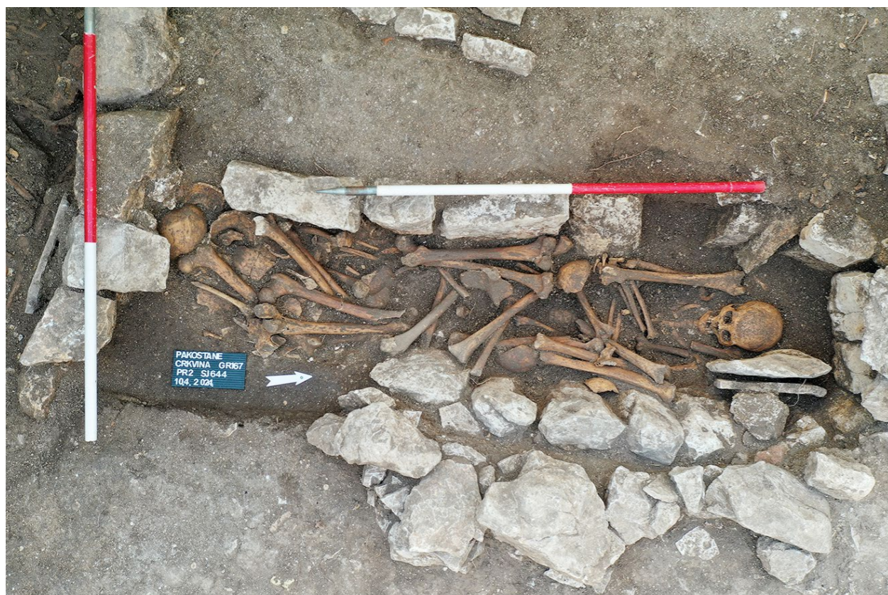
Grob 167, primjer najčešćeg tipa grobova na lokalitetu Grave 167, an example of the most common type of graves at the site