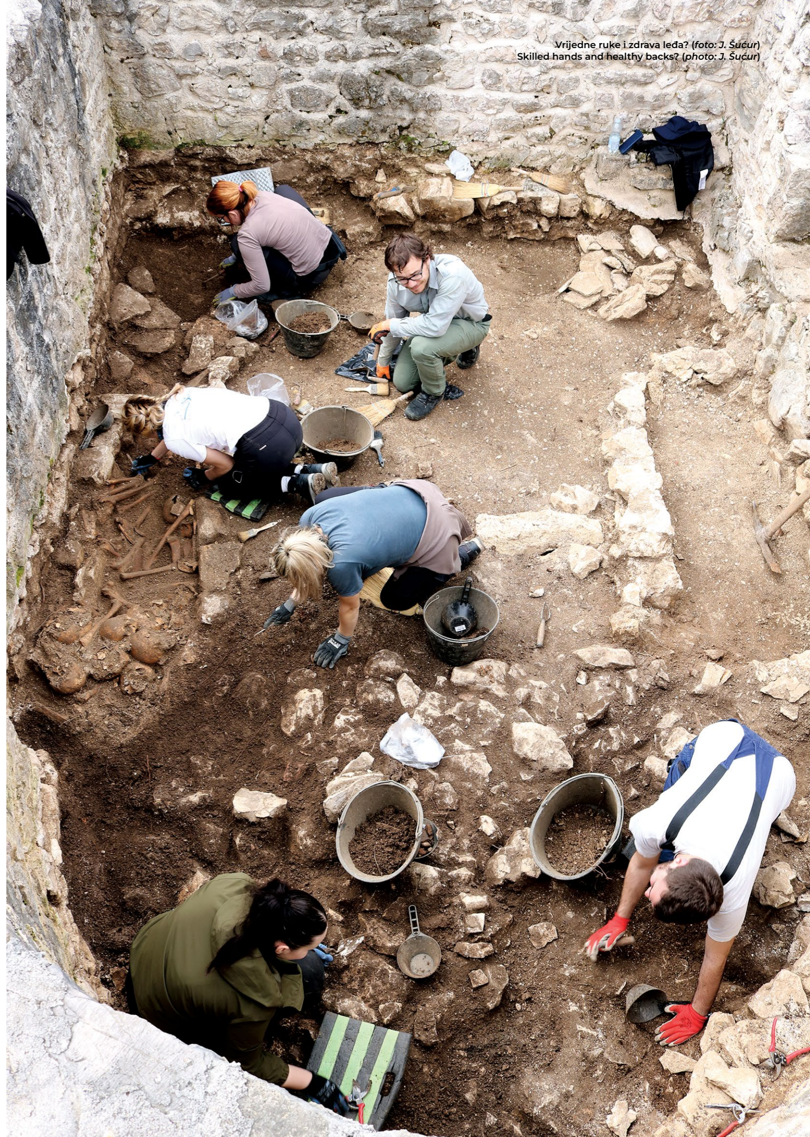
Vrijedne ruke i zdrava leđa? Skilled hands and healthy backs?