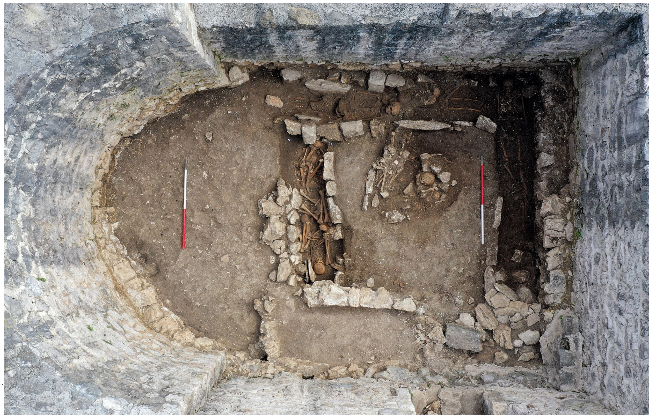
Brojni grobovi na gotovo cijeloj površini prostorije Numerous graves covering almost the entire surface of the room

We can say that two layers of graves were explored, and the burials continue further in depth. Twelve additional graves (5a, 161 – 171) were defined, most of which were explored in full despite the complex stratigraphic situation, while some were explored partially. Namely, almost entire surface of the room is covered with differently oriented tombs built of various stones and stone slabs, which completely or partially enclose the deceased, most of which are not in the anatomically correct position but are dislocated bones of a number of the deceased. Thus,