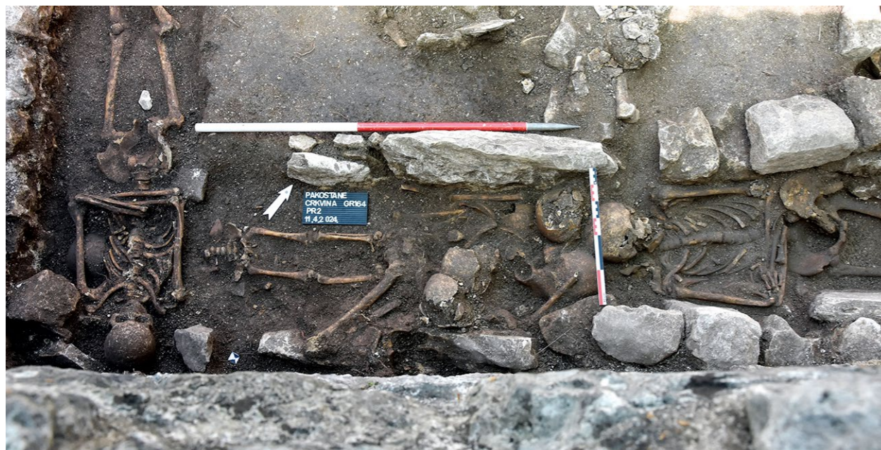
Grob – gdje počinje, a gdje završava? A grave – where does it begin and where does it end?