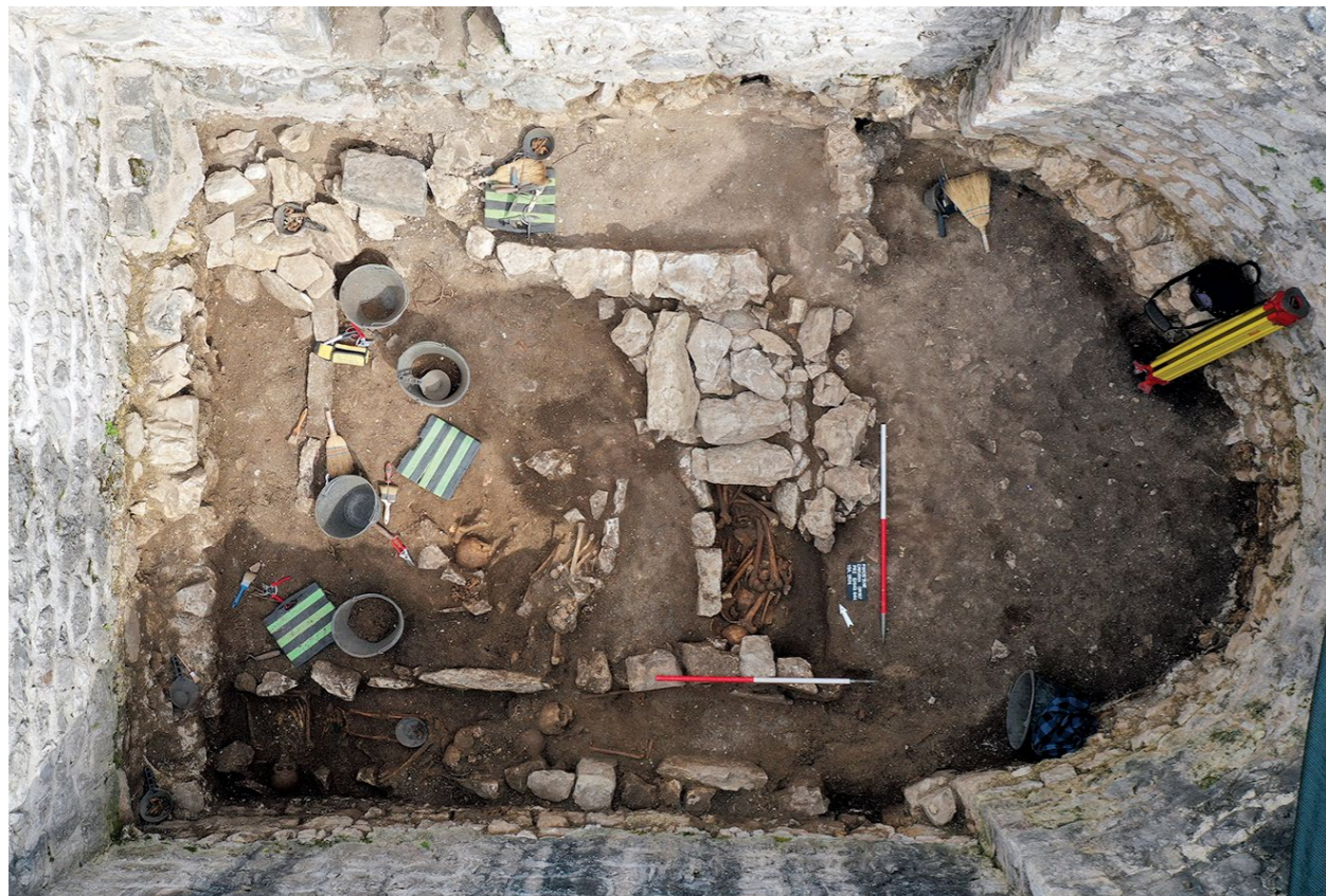
Prostorija istraživana tijekom 2024. godine s prvim slojem grobova ispod popločenja Room excavated during the 2024 season with the first layer of graves beneath the pavement